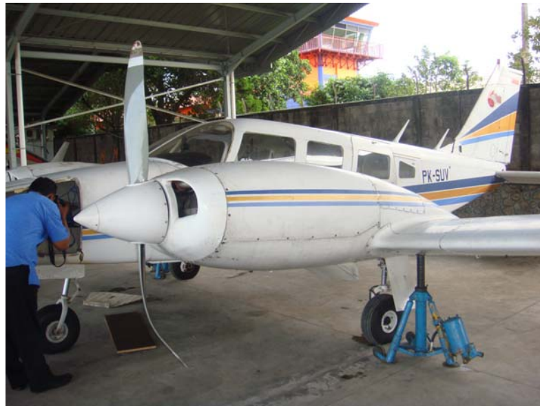
Figure 3: The aircraft was intact, left engine propeller blades were bent, nose section was damaged