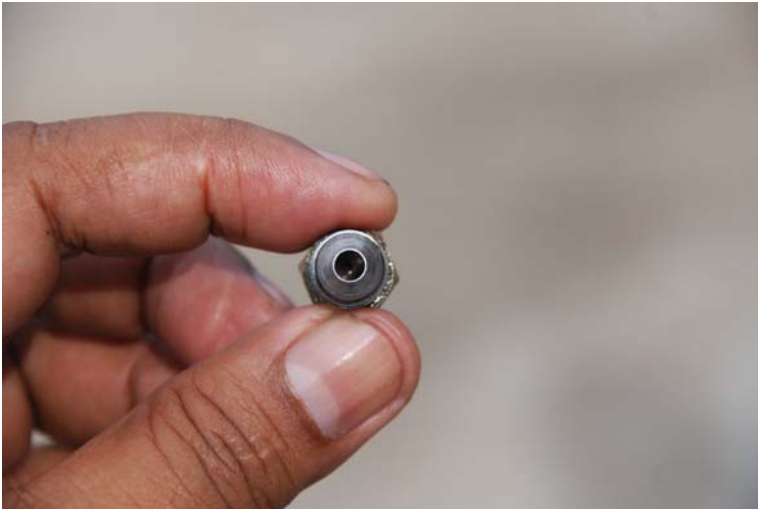
Figure 6: Hydraulic restrictor 0.31 diameter