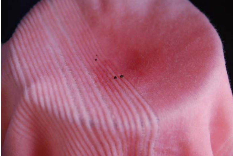
Figure 5: Dirt revealed on the hydraulic line between restrictor and actuator of nose landing gear