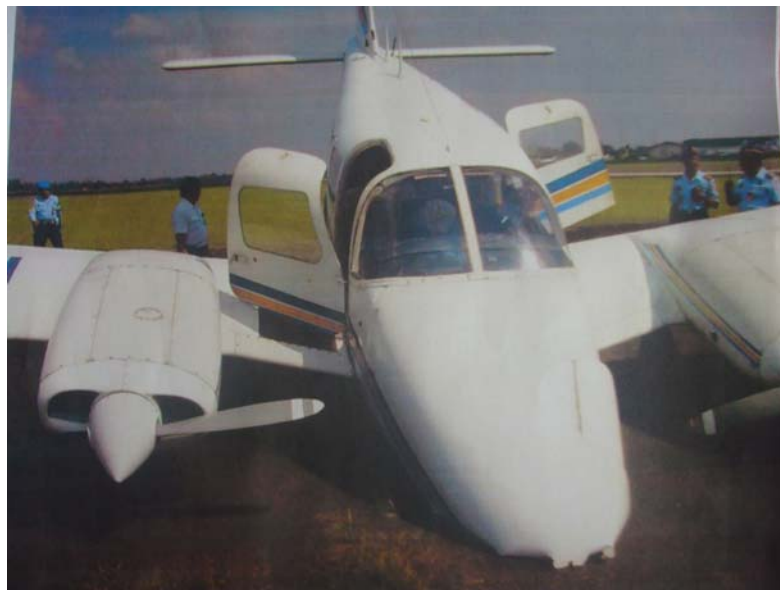
Figure 1: PK-SUV accident site, nose section on runway, nose landing gear was not extended

Pilot and 3 passengers disembarked normally without injuries.