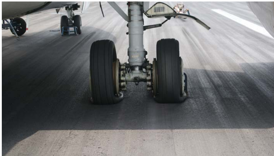
Figure 3: Main landing gear wheels three and four