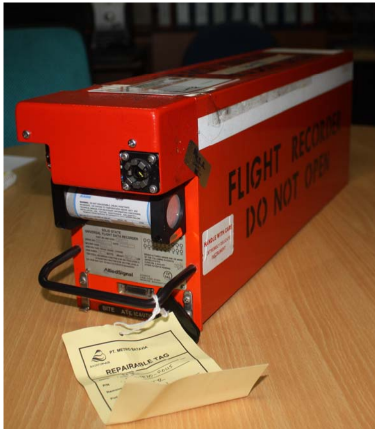
Figure 6: Flight Data Recorder

FDR Manufacturer : Honeywell Model : 980-4120-GQUS Serial Number : 20473