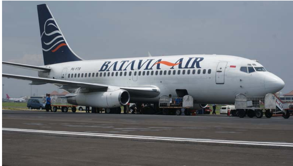
Figure 8: The aircraft at the final position (N6 intersection)