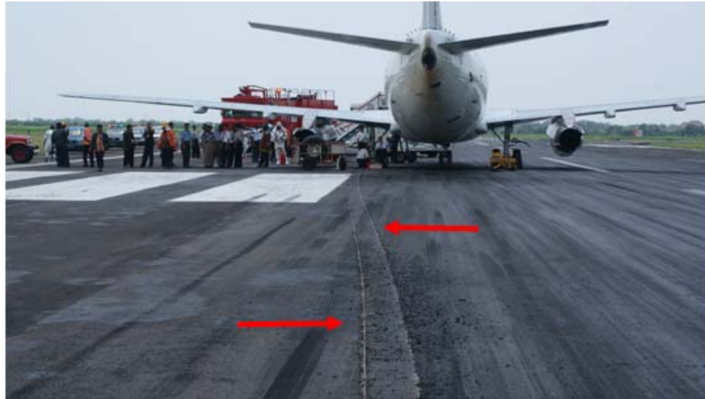
Figure 4: Runway damage