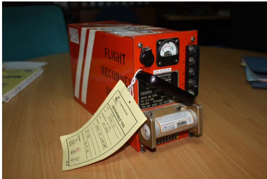
Figure 7: Cockpit Voice Recorder

CVR Manufacturer : Honeywell Model : 93A100-80 Serial Number : 56473