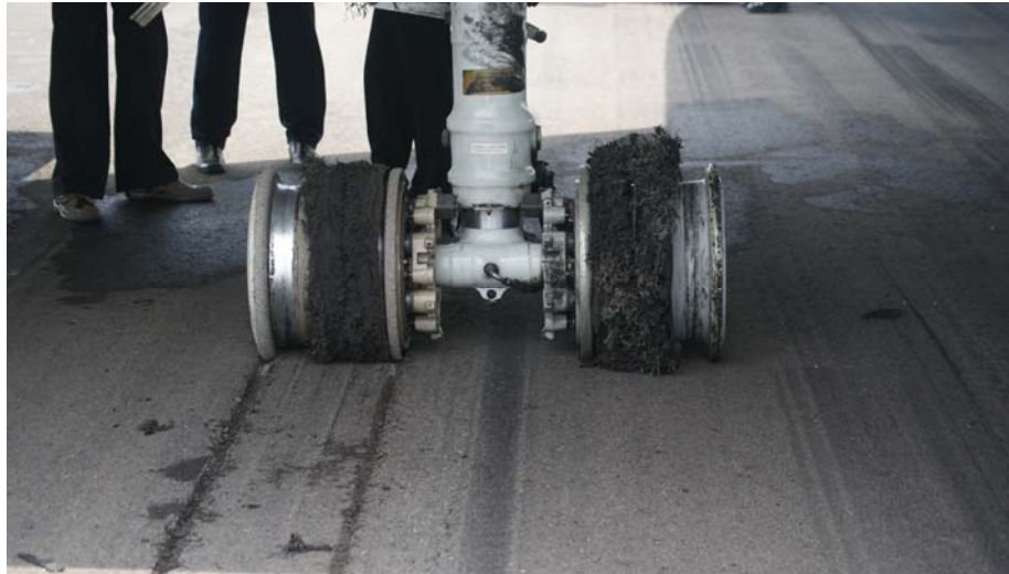
Figure 2: Main landing gear wheels one and two